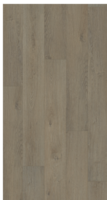
New River Oak WP1272_00010