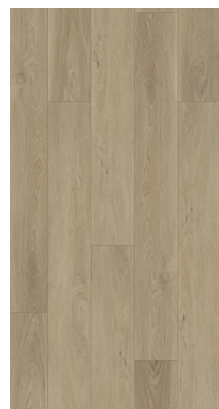
Sweetwater Walnut WP1272_00013