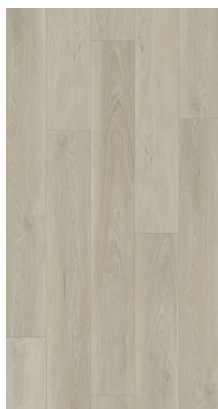
Cloudland Walnut WP1272_00012